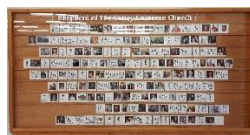
PHOTO BOARD UPDATE

Read bulletin insert for details on the variety of opportunities available for several more volunteers, and add your name to the sign-up sheets on the board.