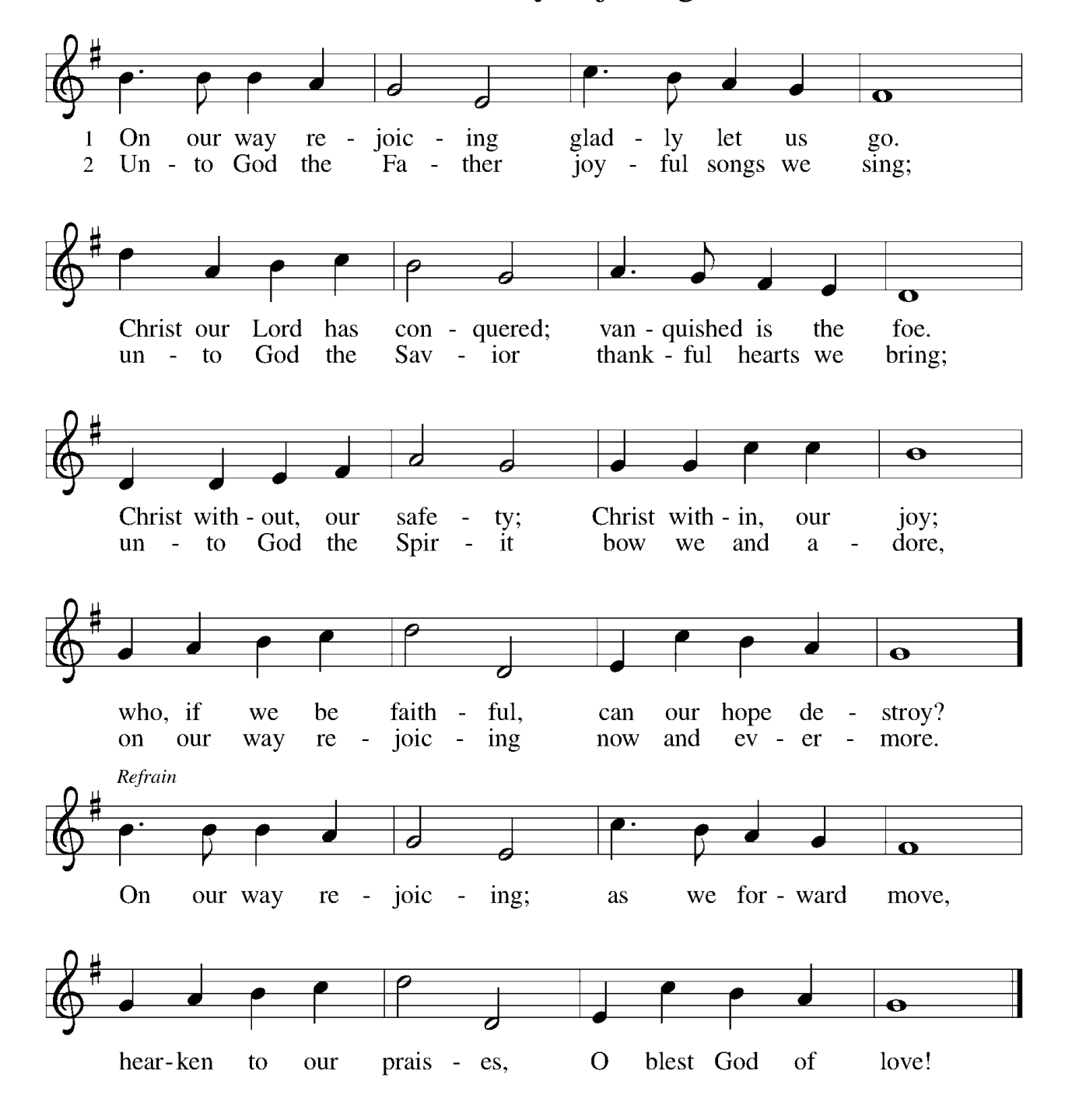
DISMISSAL Alleluia! Go in peace. Rejoice and be glad. Thanks be to God. Alleluia!