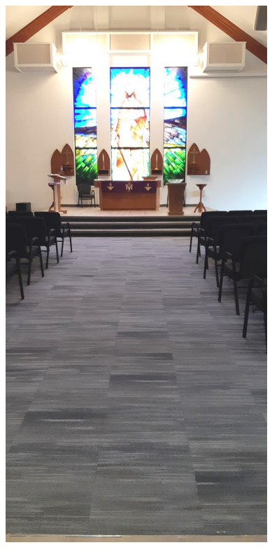
Major renovations are now complete. Minor finishing tasks around the building are still pending.