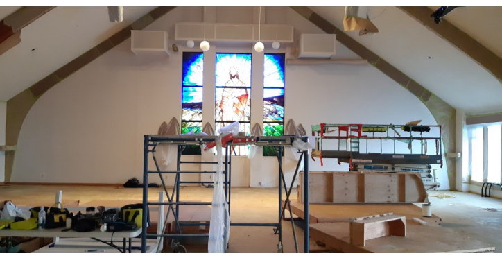
Painting (walls & ceiling) and staining (window trims, wood panels at back) in the Sanctuary . . .