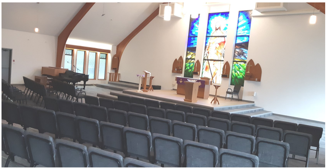
The old pews are replaced by handsome, comfortably padded chairs . . .